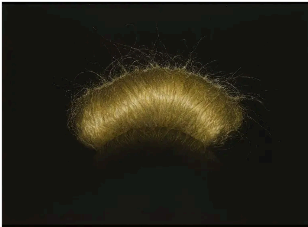
Oh Jeong-il: Alive (2009). Acrylic on linen by a single strand brush

Born in 1972, Oh Jeong Il depicts hair-styles with each hair meticulously, drawn one by one with a single strand brush on a black background.