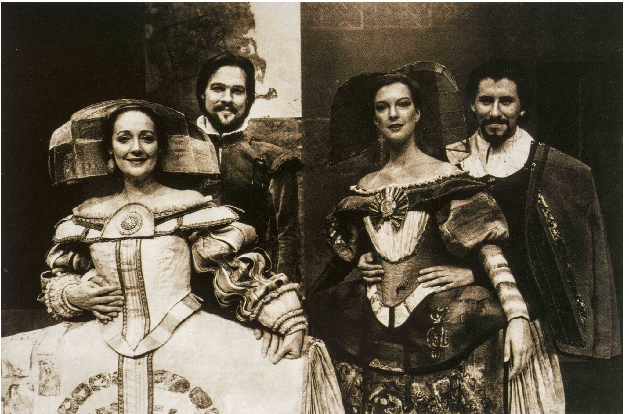
Stage scenery and costumes for The Merchant Of Venice, Washington D.C., 1982