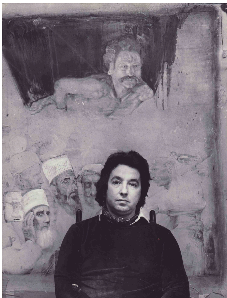
In his studio, Sarajevo, 1980