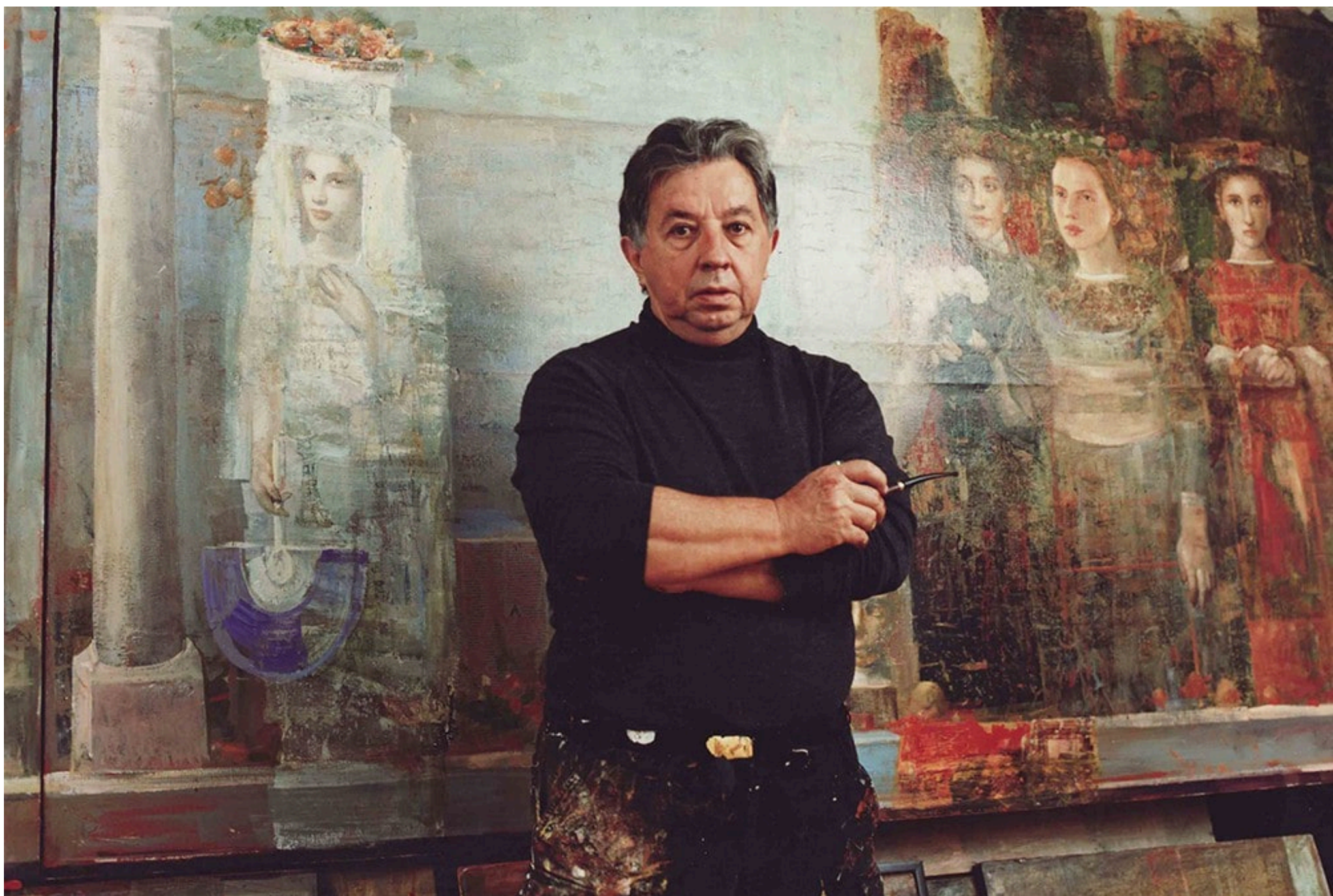
In his studio, Zagreb, 2003