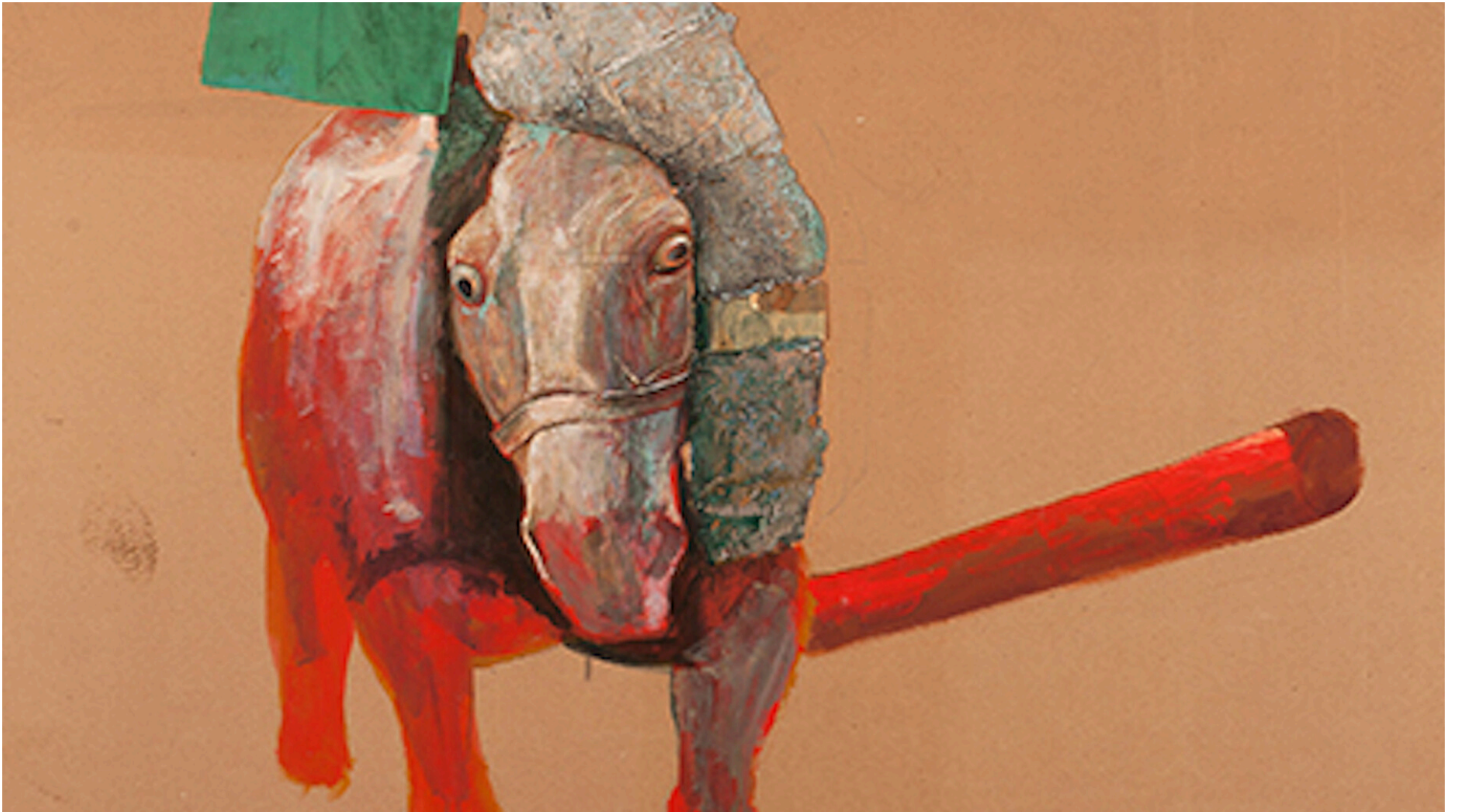
Mersad Berber. Courtesy of Pera Museum

Mersad Berber (1940 – 2012) is one of the greatest and most significant representatives of Bosnian–Herzegovinian art from the second half of the 20th century. His vast body of expressive and unique works triggered the local art scene’s recognition into Europe as well as the international stage.