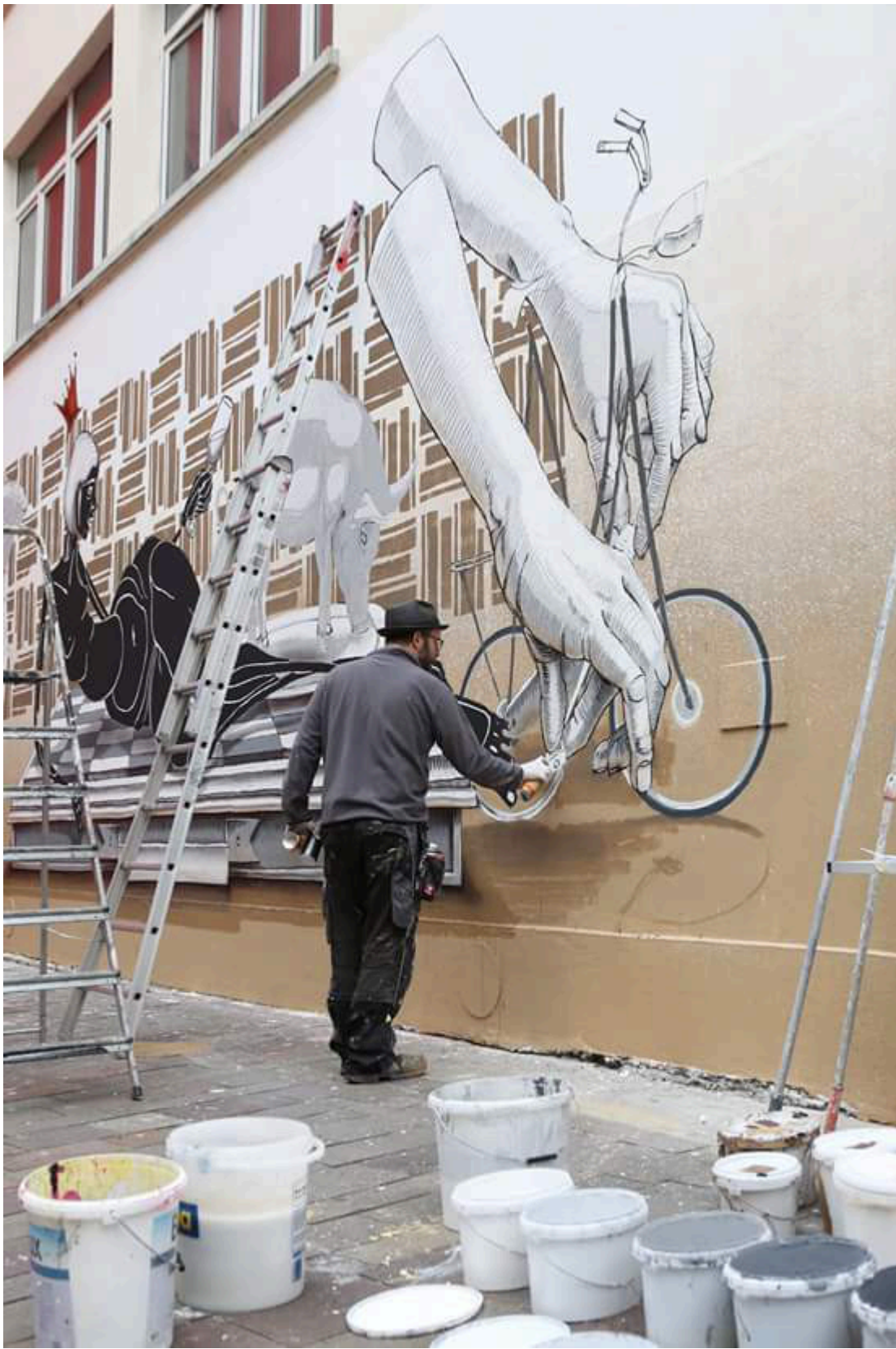
At work in Mulhouse/France