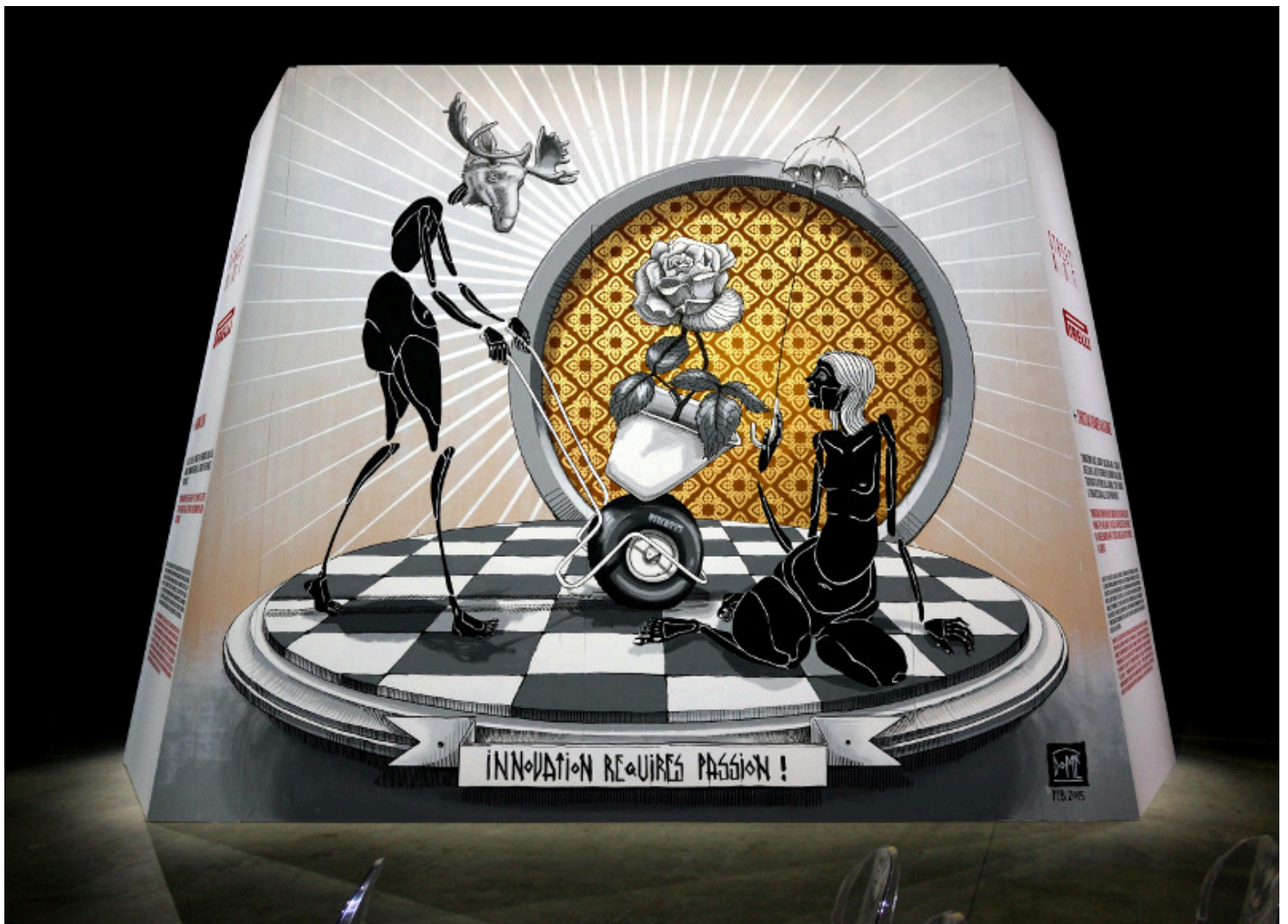
'Innovation requires passion' for Pirelli. Hangar Bicocca in Milan, Italy (2015)