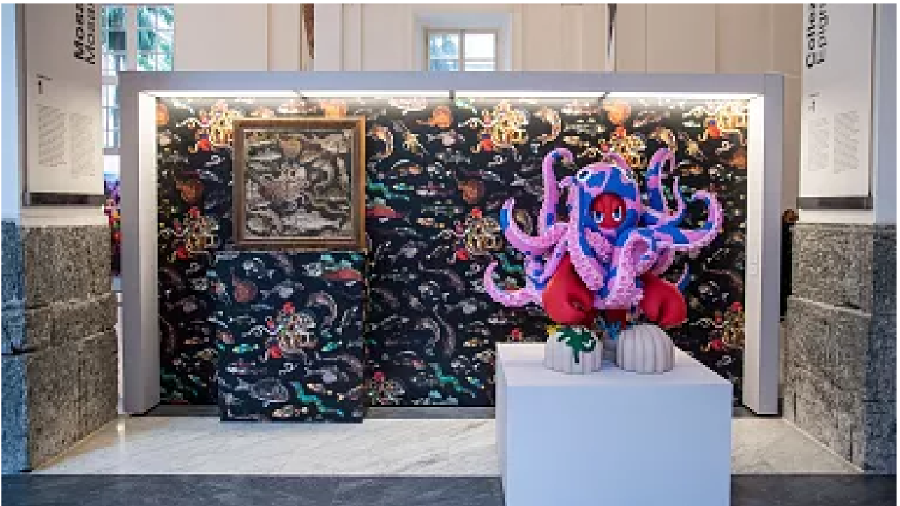
Various works by Philip Colbert on display alongside the great Pompeii lobster mosaic at the National Archaeological Museum of Naples

My new exhibition, "House of the Lobster", is very exciting for me personally, because many of the works in the Archeological Museum of Naples are, in my mind, the blueprints of art history. My aim was to create a dialogue between the new and the old.