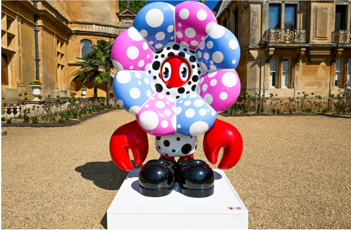
Philip Colbert's Lobster Takeover exhibition At Waddesdon Manor, Photo by Dave Benett/Getty Images Courtesy Philip Colbert Studio

Set within the historic gardens of Waddesdon Manor, the series of sculptures depicting lobsters in disguise as flowers create a striking contrast between contemporary pop art and classical architecture, showcasing Colbert's enduring commitment to making art that is both playful and widely accessible. Colbert's surreal twist on the flower symbol as a powerful, universal metaphor of beauty, renewal and nature's ongoing cycles, delves into themes of rebirth and transformation, with the lobster — a creature known for moulting its shell— symbolising regeneration and change.