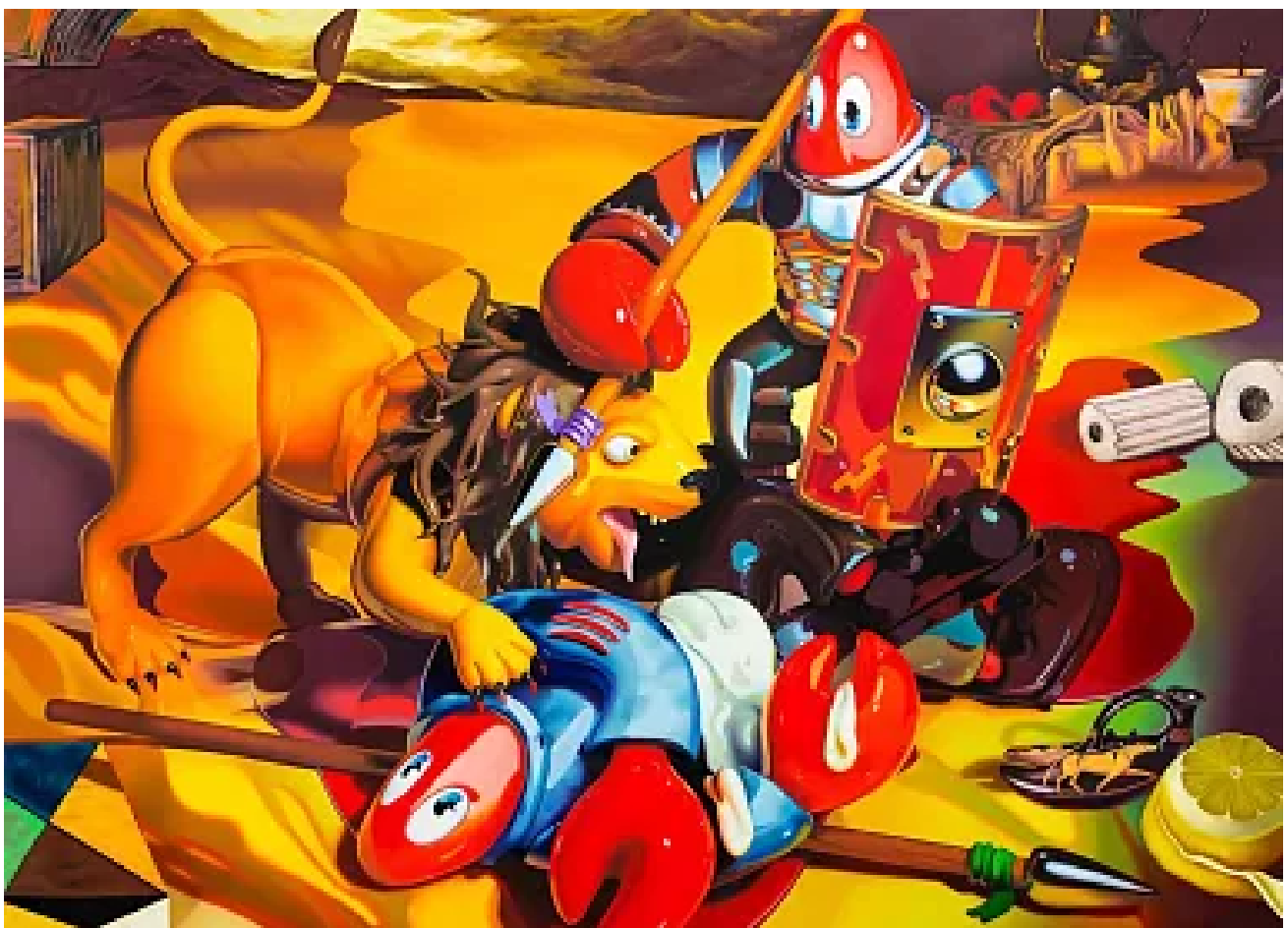
'Gladiators and Lions' by Philip Colbert

Are you inspired by music? Do you ever listen to music while you work?