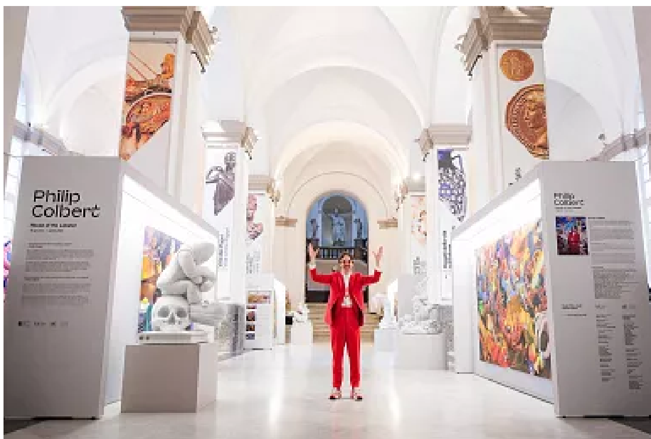
Philip Colbert photographed at the opening of his latest exhibition 'HOUSE OF THE LOBSTER' at the National Archaeological Museum of Naples

Before its opening, Euronews Culture had the pleasure of meeting the "Lobster Man" himself at his London studio - a sprawling, whimsical playground filled with inventive creations. There, we took a deep dive into his colourful artistic universe and uncovered his deep-seated infatuation with the curious crimson crustacean.