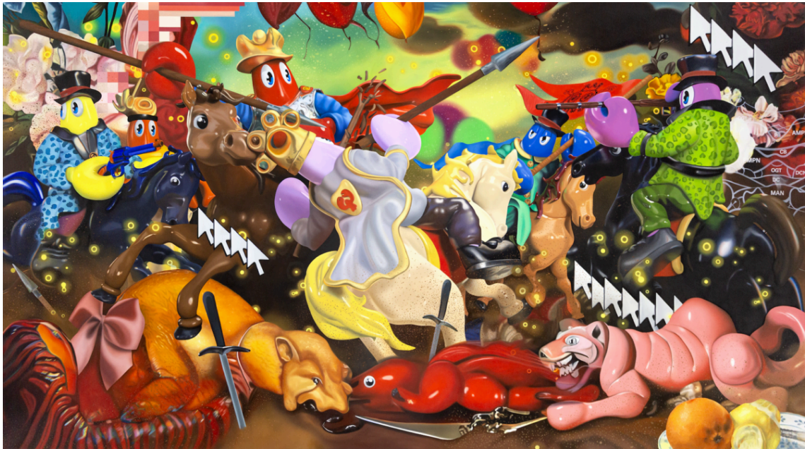
Philip Colbert, A.I. Battle Scene II, 195x350x5cm, Oil on Canvas, 2023

Old Masters meet AI in Philip Colbert's new battle scene exhibition at Saatchi Gallery titled The Battle for Lobsteropolis the new exhibition opens on Friday 29th November 2024.