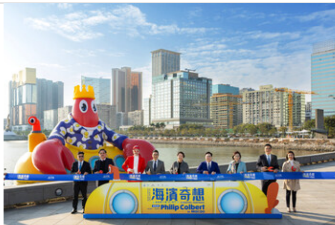
Guests of honour officiate an opening ceremony Wednesday at the Macao Science Center waterfront to celebrate world-famous pop art master Philip Colbert's colourful maritime and cultural tourism art exhibition, Coastal Fantasia: The Lobster King's Vacation in Macao.

MACAO, Jan. 15, 2025 /PRNewswire/ -- Sands China held an opening ceremony Wednesday at the Macao Science Center waterfront to celebrate world-famous pop art master Philip Colbert's colourful maritime and cultural tourism art exhibition, Coastal Fantasia: The Lobster King's Vacation in Macao , which features massive installations of his iconic Lobster cartoon persona.