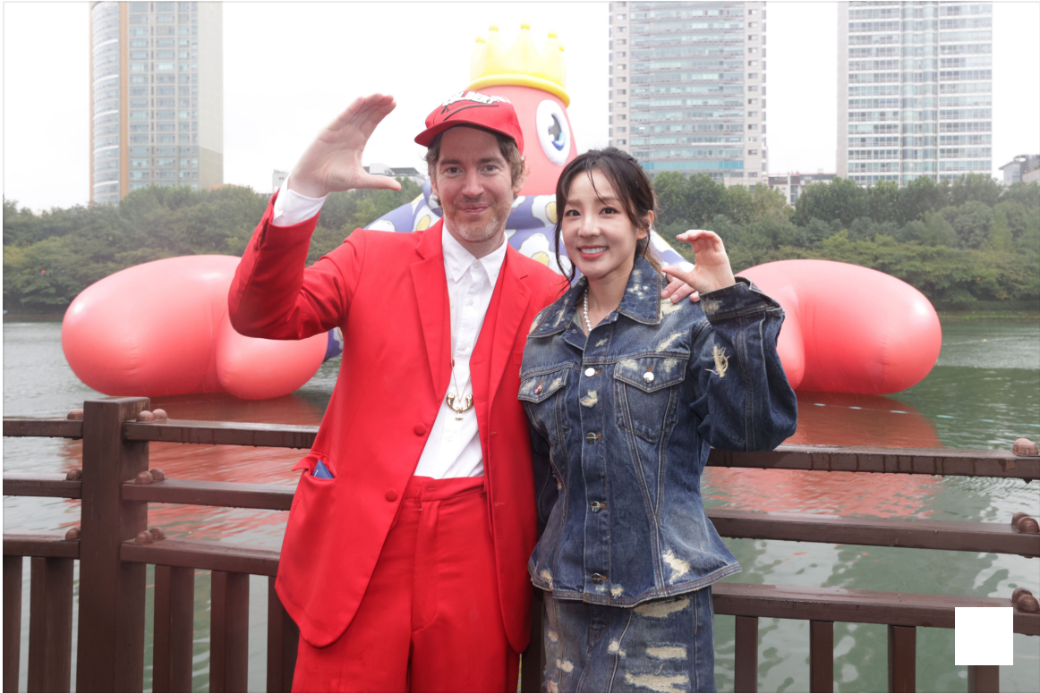
Girl group 2NE1 member Sandra Park, right, and British pop media artist Philip Colbert pose for a photo in front of the "Floating Lobster King" on display in Seokchon Lake from Friday to Sept. 26.

"A key core to my philosophy is the belief in the value of everyday imagery. There's been a historical misconception that value is protected and separate from daily life, but I'm interested in the poetry of the everyday, in a language that is accessible to a wide audience," he said.