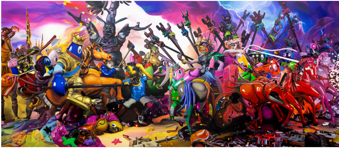
After Battle of Issus Mosaic, 195x450x5cm, Oil on Canvas-2023