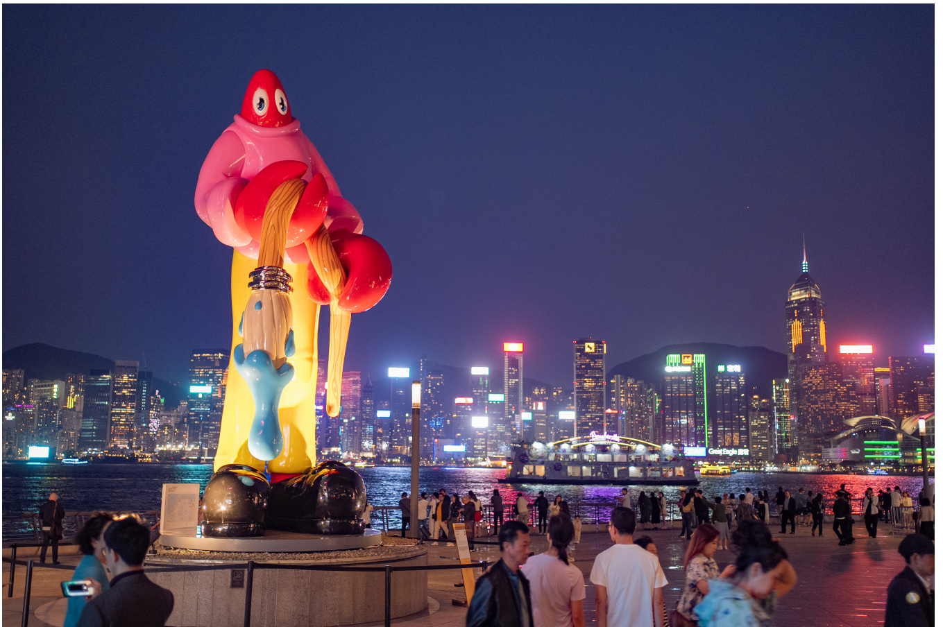
THE LOBSTER PAINTER adds a bold and interactive dimension to Hong Kong's Arts Month

Each collectable will represent a shared connection to the monumental sculpture itself, while, through blockchain-powered ABCs, collectors will become co-collectors of THE LOBSTER PAINTER . As a special highlight, co-collectors will also have the unique opportunity to have their names on a sign at the base of the collectable. Part of the proceeds from the sale of the collectable will be used to continue supporting the development of contemporary art through KAF's art and culture programmes.