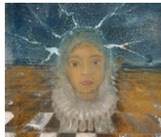
"Once Upon a Time"