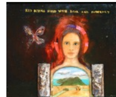
"Red Riding Hood with Bear and Butterfly"