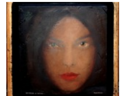
"Something in the way"