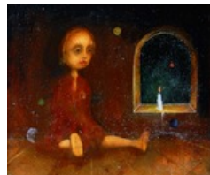
"Maybe you are blind but you still don't see"